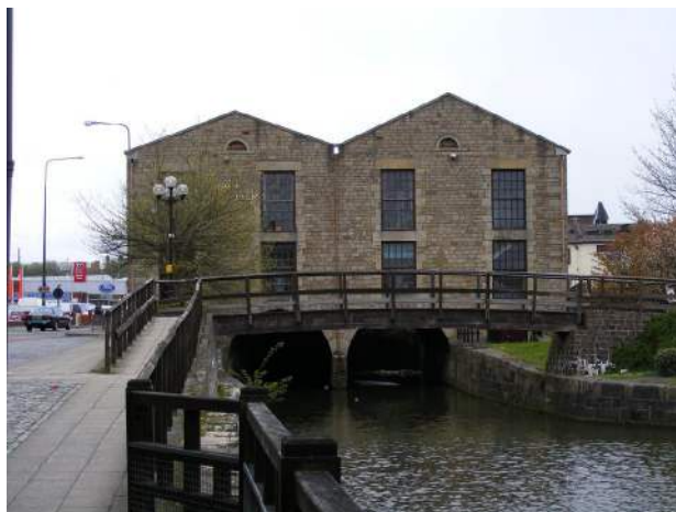
Illustration 1:

Unitary Authority, NW England (Greater Manchester), Labour controlled council, popn 305,600, mostly urban.